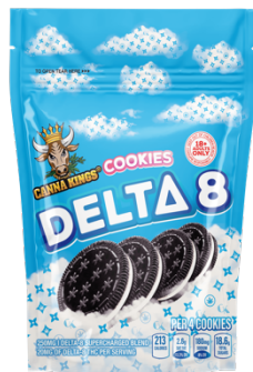
CANNA KINGS 25

"THC Hot Cheetos are infused with 600MG of Delta 8 THC in a single bag and can easily be finished in one sitting."