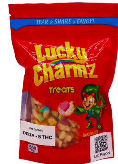
TOP 5 WHOLESALE 27

"In around 3% of people, THCO produces very powerful, almost psychedelic effects. For the rest of the 90%, it's ...very strong and potent..."